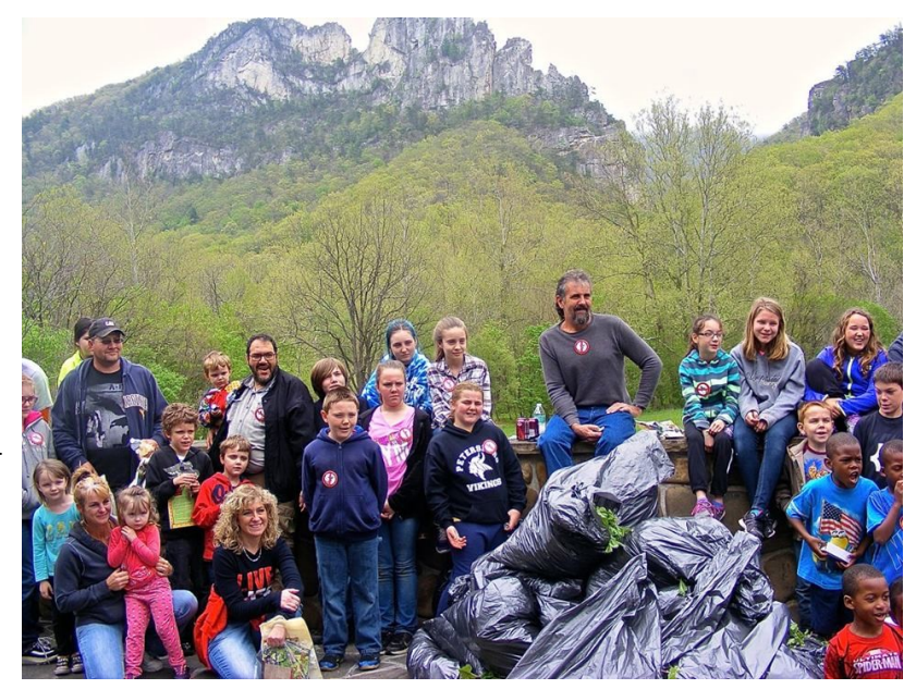
Brandishing their "Weed Warrior" pins, attendees of Discover Nature Day 2016 triumphantly lord over their haul of garlic mustard.

The Potomac Highlands CWPMA includes Bath, Highland, Augusta, Rockingham, Page, and Shenandoah counties in Virginia as well as Grant, Hardy, Tucker Pendleton, Randolph, and Pocahontas counties in West Virginia. Member organizations perform invasive species treatments on both public and private